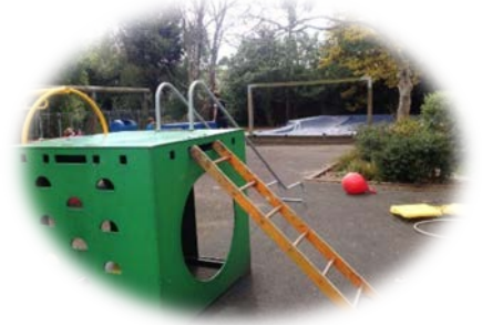
Athletic in the garden