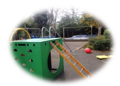
Athletic in the garden

Teachers want kids to grow physically and mentally with their teachers, parents and neighbors.